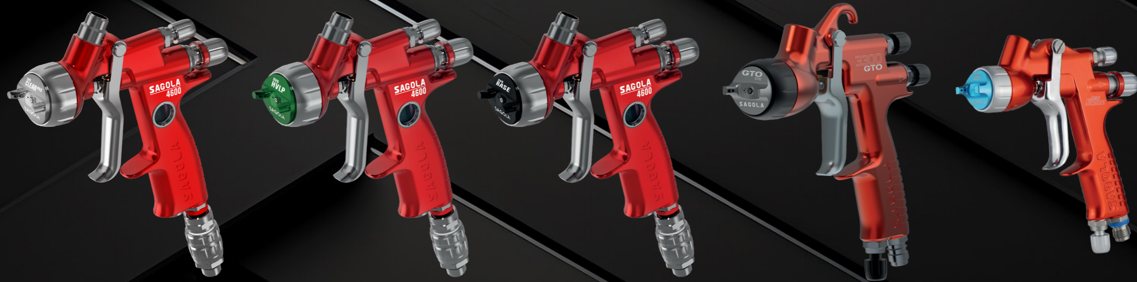
DVR CLEAR PRO SAGOLA 4600