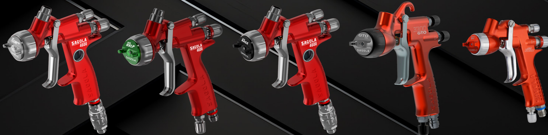
DVR CLEAR PRO SAGOLA 4600